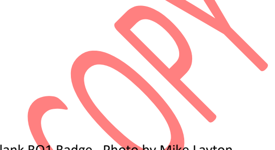
Blank BO1 Badge.

Of the 136 drums with Blank BO1 badges where the shell type is known, shell type is distributed between metal (38) and wood (98). The metal shelled drums with Blank BO1 badges have vent holes located well above the center bead, so the full-sized badge fits easily. About 7.2% (139/1,926) of the total BO1 badges recorded are Blank BO1 badges.