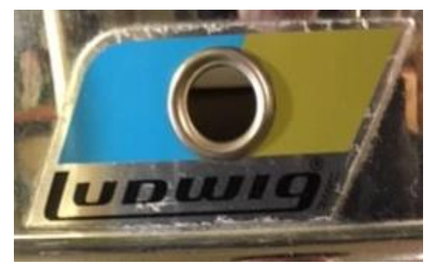
Trimmed BO2 Badge.