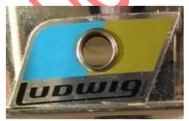
Trimmed BO1 Badge.

The majority of metal-shelled drums made after 1969 badge switch were drilled with the necessary higher vent hole location and were given intact, full-sized BO badges. However, at various times shells drilled with a lower vent hole location appear. For these, Ludwig trimmed or cut the bottom portion of BO1 and BO2 badges so they would fit. These are referred to as "Trimmed BO1" and "Trimmed BO2" badges, respectively. Because the bottom portion is missing, it is unknown if these trimmed badges were BO1 and BO2 badges with serial numbers, Blank badges or modern reproduction BO2 badges.<sup>11</sup>