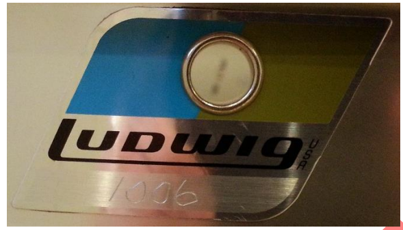
Etched BO1 Badge.

Some vintage drum enthusiasts have suggested that the etched numbers identify these drums as prototypes, dealer samples or drums specially made for endorsers. However, except for the etched numbers, there is nothing remarkable or out of the ordinary about any of these drums. For example, five of them are ordinary Acrolites. The 15 drums with etched numbers have a mix of wood (6), metal (6), Vistalite (2) and unknown (1) shells. It is not clear why they received etched numbers or what the etched numbers mean.