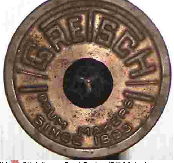
Skinny Stick/Large Font Badge (author)