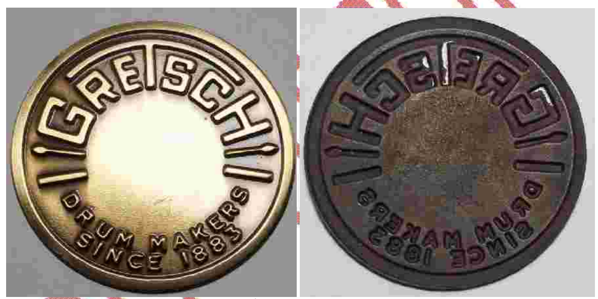
Apparent Reproduction Badge (Bill Maley)