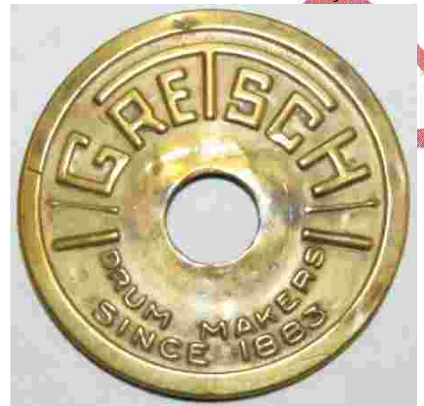
"ROBBINS CO. ATTLEBORO" on obverse, textured finish. Date Unknown (author)