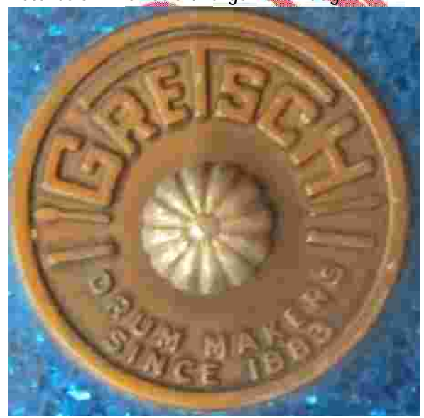
Thick Stick/Large Font Badge (author)