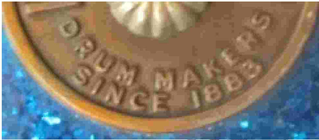
Detail of Thick Stick/Large Font Badge (author)