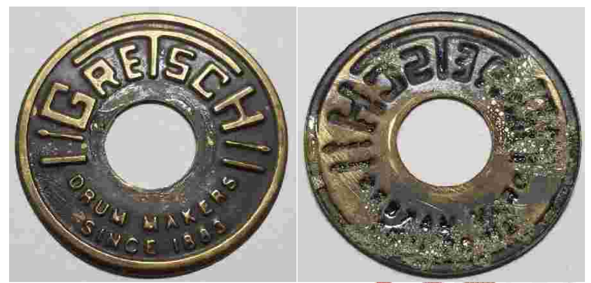
Apparent Counterfeit Badge - Note inconsistent angles of sticks. (Bill Maley)