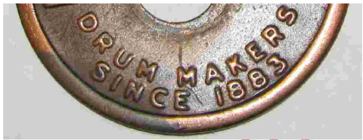
Detail of Thick Stick Copper Badge (author)