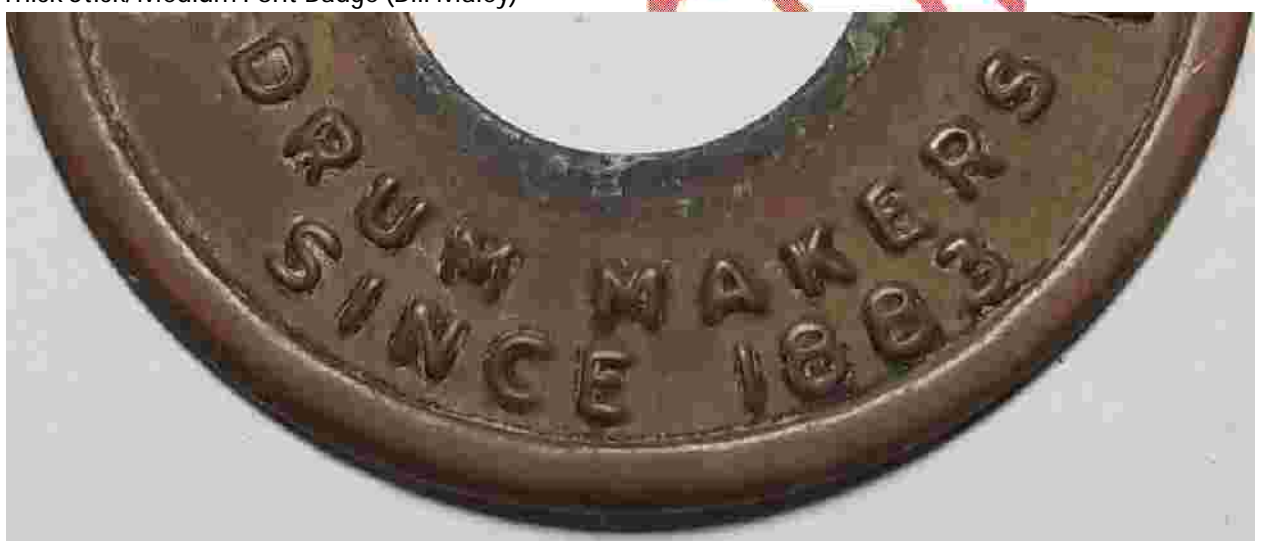
Detail of Thick Stick/Medium Font Badge (Bill Maley)