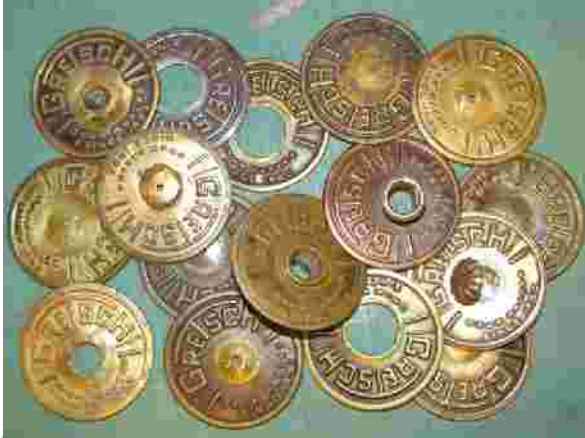
Badges salvaged from damaged drums (Bill Maley)