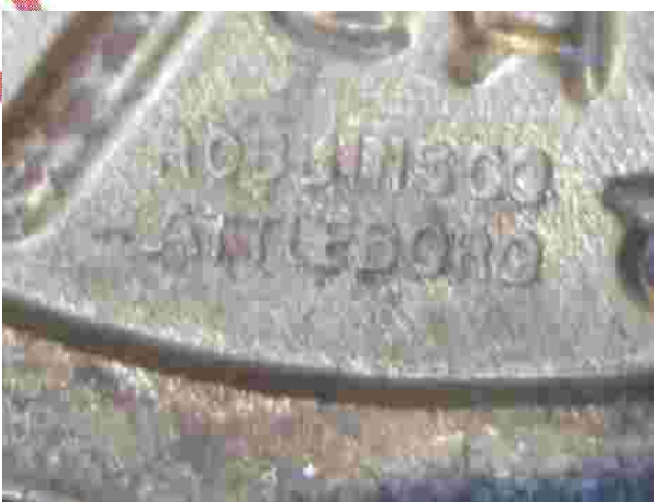
Detail of "ROBBINS CO ATTLEBORO" mark. Date Unknown (author)