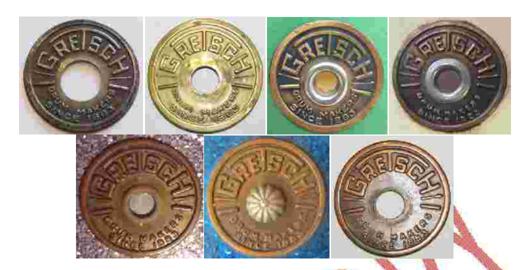
Identifying Multiple Versions of the Gretsch<sup>1</sup> Round Badge - 1930s – 1960s One Additional Tool for Assessing Vintage Gretsch Drums