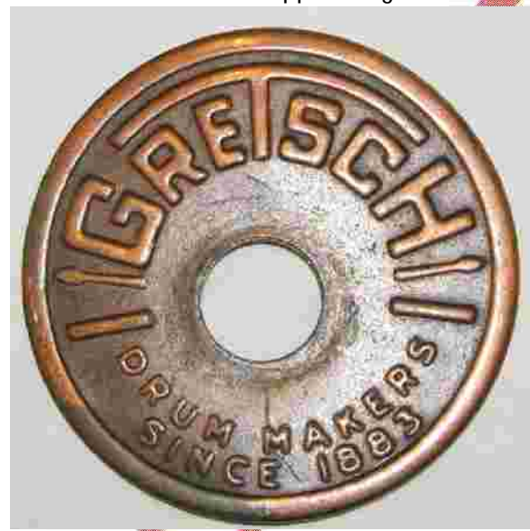
Thick Stick/Copper Badge (author)